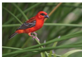
Red Bird Travel News