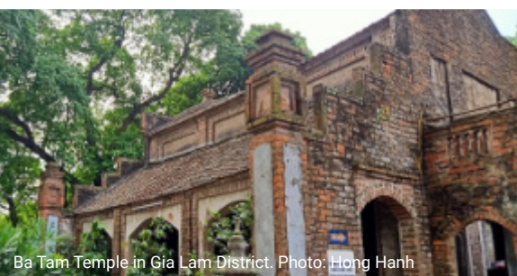
Ba Tam Temple in Gia Lam District.